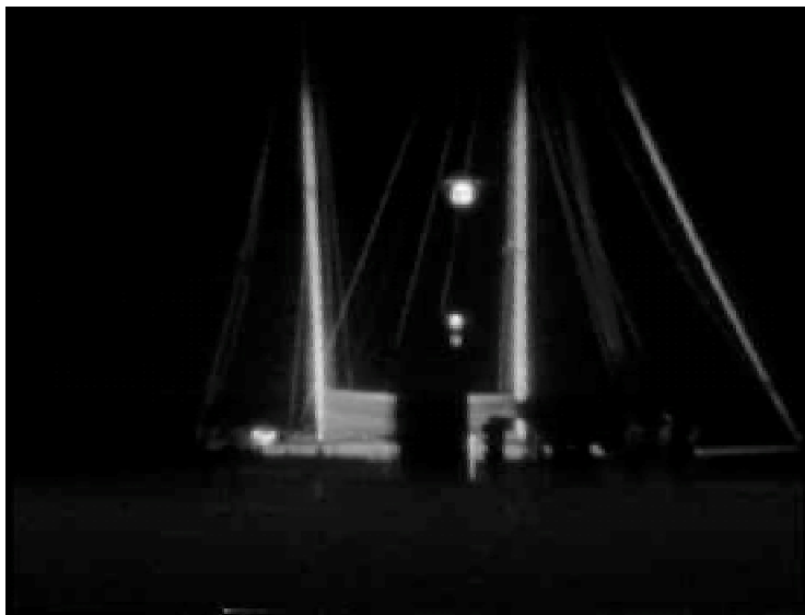
Image appears a bit oversaturated as the syntectic cloths gives a good IR reflex.. The man carry an optical assembly and this appears a bit whiter than the rest of the image

Same place and same man with same view but here we illuminate the boat behind the man and he is in the darkness if front of the illuminated field of view.