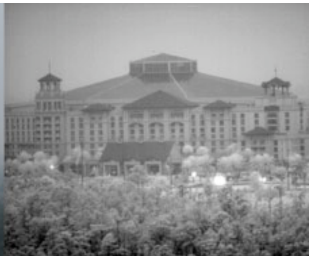
Daylight impression. Right view of area in visible spectra. Left zoom up of a part of the viewed area.