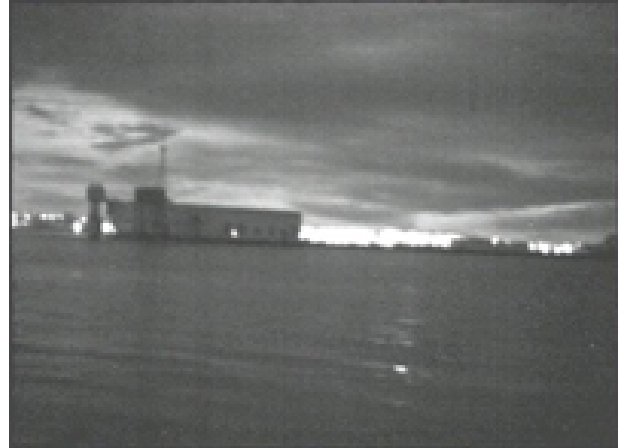
Left CCD in visible light of spectra. Right same image but in near IR areas